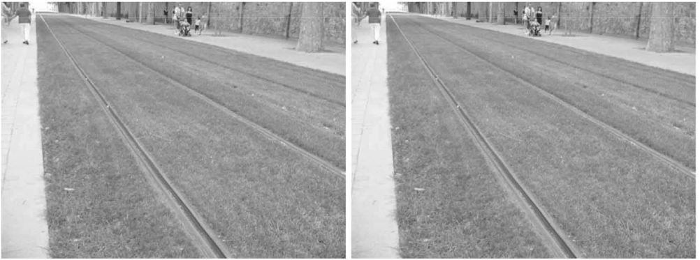
Figure 3. Photograph of tram lines.

Acknowledgment. This research was supported by a Canadian Institute of Health Research grant (#MOP-11554) given to FK.